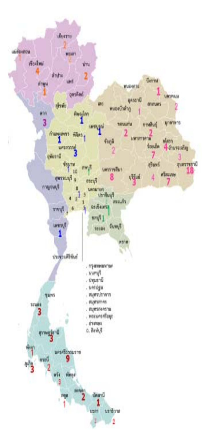
Chart 1: Geographical Distribution of Scholars